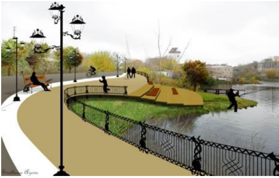
Design of Ivangorod promenade