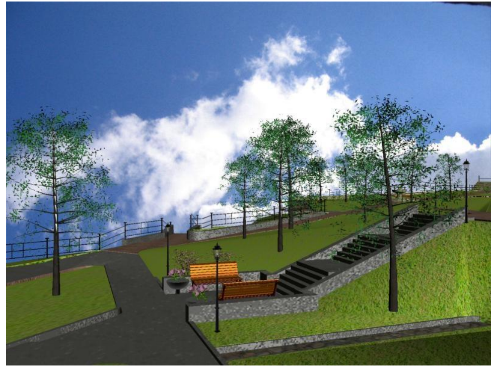
Design of Narva promenade

The object in Narva is the upper part of the promenade with the total area of 4 700 m<sup>2</sup>, precisely the part of the Dark Garden Park starting from the Hahn staircase till the fountain, and the road along the park territory. On Ivangorod side it's the part of the river promenade with the total area of 3570 m<sup>2</sup> located to the north of the fortress and thematically meant for Fisher market.