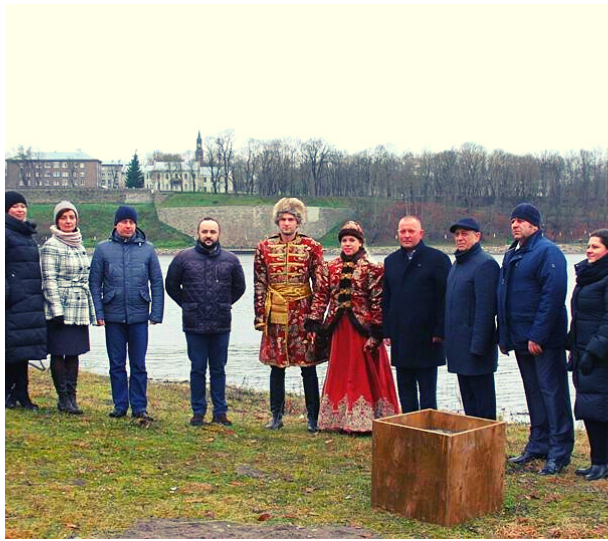
The cornerstone is laid in Ivangorod

On the 19th of November 2020 the cornerstone was laid in Ivangorod on the place where the next part of Ivangorod river promenade will be constructed in the nearest time.