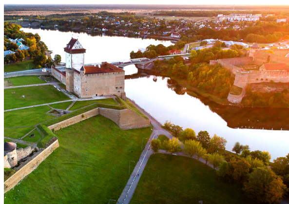
View to Narva Castle, Ivangorod Fortress and River Promenades

The historical riverside areas both in Narva and Ivangorod urgently require further renovation to prevent their destruction. The construction of the river promenades will make the territory safer and more comfortable for tourists and visitors. Further building of the promenades on both sides of the Narva River and measures for their exploitation can be accomplished within the framework of the integrated project because only in this case the project realization will encourage the best possible synergy and the most positive contribution to the achievement of the project's goal. This will make the cross-border cooperation between the towns more productive and effective.