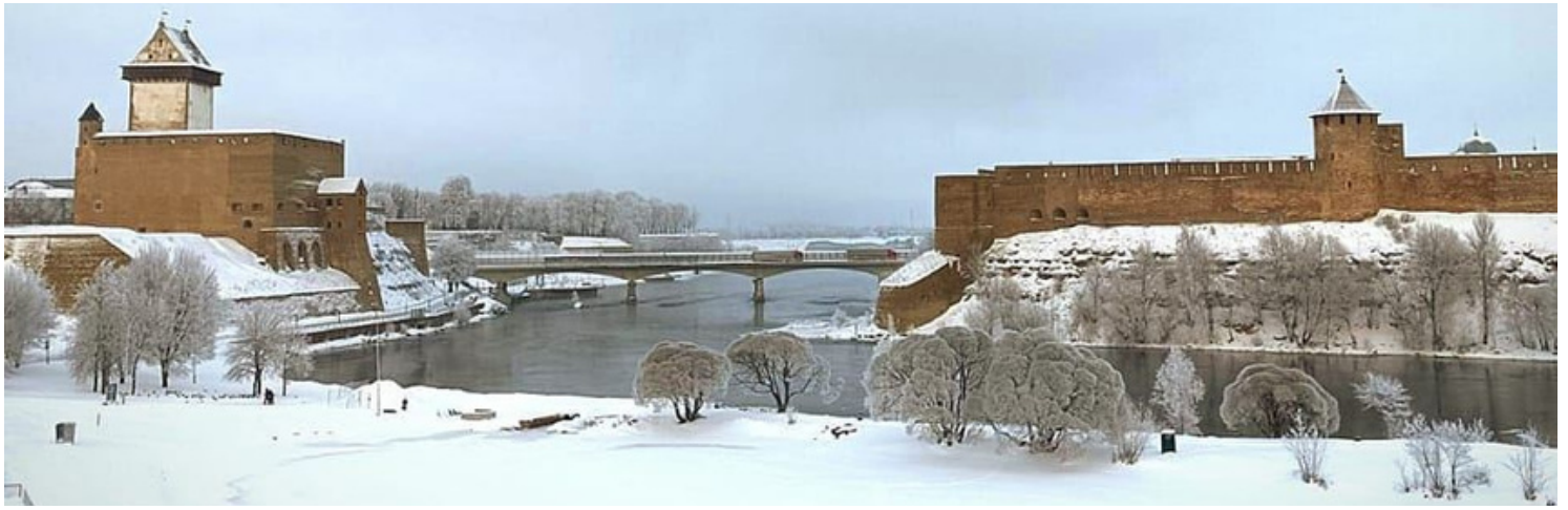
Narva Castle and Ivangorod Fortress